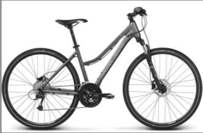
Ladies Trekking Bike