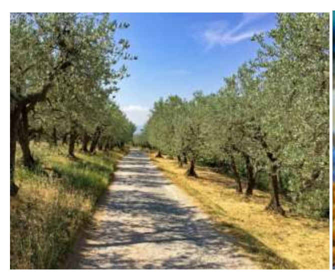
Day 8: Departure or Extension of Trip

In the middle of the green heart of Umbria, you will pass huge mountains until you reach Calvi, the last major town in this region. You can still enjoy the quiet and solitude of the Sabine mountains before you take the train to immerse yourself in the vibrant city of Rome