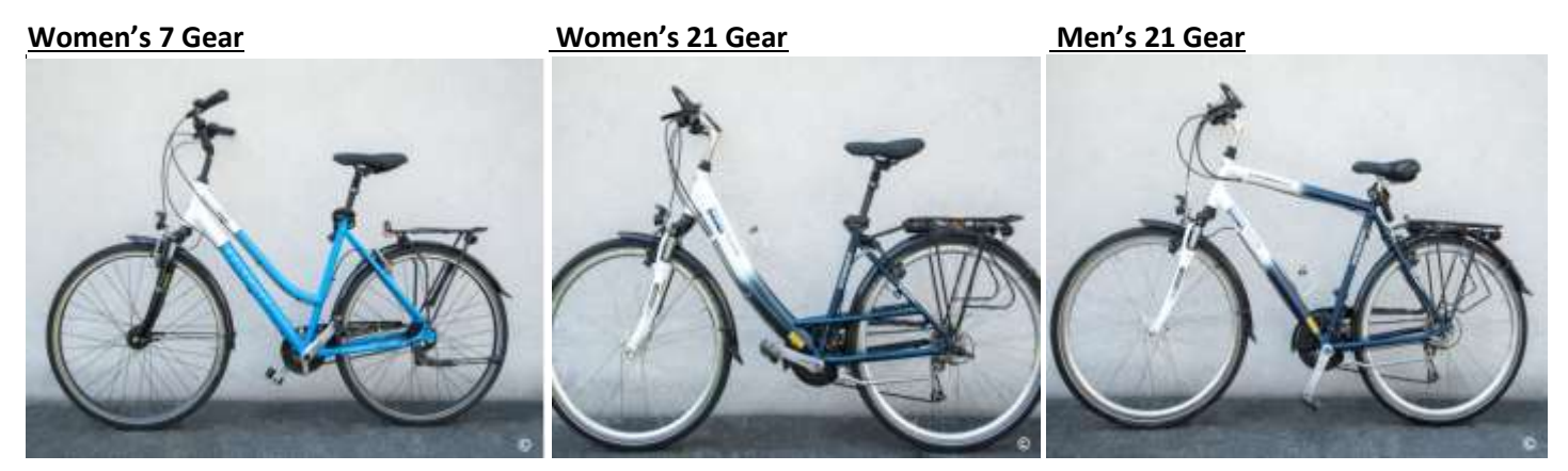
Women's 7 Gear touring bike with coaster brake for heights between 1.45 m and 1.94 m Women's 21 Gear touring bike with freewheel function for heights between 1.45 m and 1.94 m Men's 21 Gear touring bike with freewheel function for heights between 1.61 m and 1.95 m